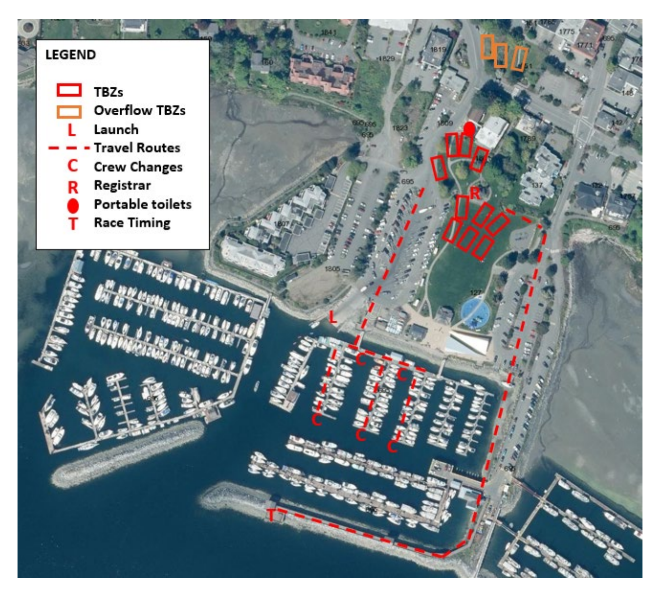
Figure 1. Site overview showing concept Team Bubble Zones and anticipated athlete travel routes.